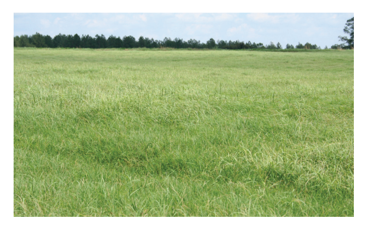
Figure 1. Damaged bermudagrass fields have a frosted appearance.

he bermudagrass stem maggot has become a pest for cattlemen and hay producers across the Southeast. If your bermudagrass hayfield has a frosted appearance (figure 1) in the middle of summer, it may have been damaged by this new, invasive pest. The damage is caused by the feeding of the immature stage of a fly, which is called a larva or a maggot. Only the top parts of the shoots are damaged (figure 2), while the lower leaves on the shoot remain green (figure 3).