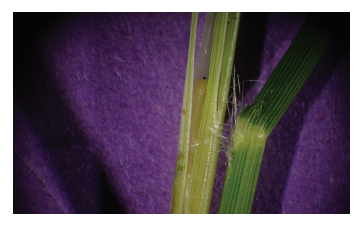
Figure 6. The larva feeds inside the bermudagrass stem.