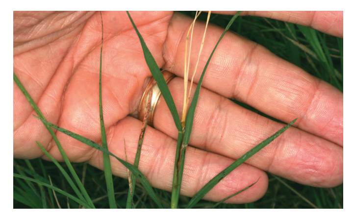
Figure 3. The bottom parts of the affected bermudagrass shoots remain green.