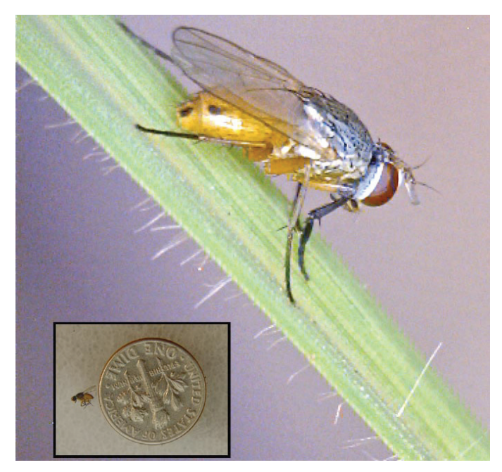
Figure 4. The adult stage of this pest is a small fly.

conditions. In those situations, it is believed that the slower growth rate due to the poorer conditions allows egg-laying and larval development to occur relatively early in the grass growth cycle.