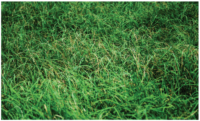
Figure 2. Only the top parts of the bermudagrass shoots are damaged, causing the frosted appearance.

In the United States, bermudagrass stem maggot (Atherigona reversura) is only a problem on bermudagrass and stargrass (Cynodon spp.). The insect has a few more grass hosts in other parts of the world, however, and it is native to south Asia. extending from Japan westward to Pakistan and Oman. Somehow it made its way to the continental United States, where it was first found in 2010 in Pierce, Jeff Davis, and Tift counties in Georgia. By the end of 2012, it was found throughout most of the Southeast. The insect has also been accidentally introduced into Hawaii. While it is not unusual for new species to show up in North America, unfortunately in this case, there is very little information about this insect, its life cycle, the damage it causes, or measures to control it. This publication summarizes what scientists at the University of Georgia have learned about the pest in the past few years.