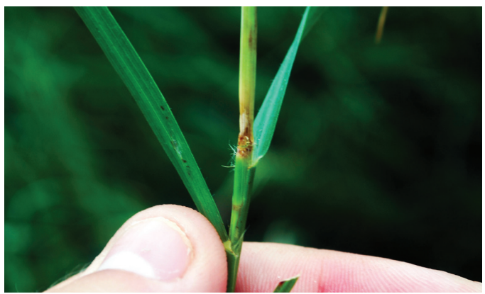
Figure 7. A closeup of a damaged shoot before the tip of the shoot has died.

grass begins to resprout and again 5 to 7 days later. The lowest labeled rate of any pyrethroid* insecticide that is approved for hayfield application has been effective. No differences have been noted among the brands or active ingredients. There is no residual activity with these insecticides beyond a few days after application. The infestation levels that cause concern usually build later in the season. Therefore, a single round of treatments may protect the grass through the rest of the growing season. Considerable reduction in damage can be seen after a single application as the grass regrows, and for late season, that may be a more costeffective option.